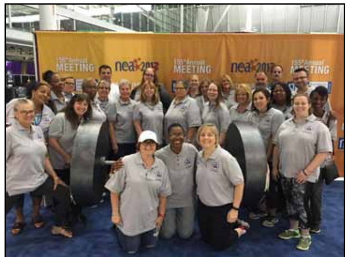
Members of the Monmouth County Education Association attended the NEARA Convention in Boston this past summer.

If I do not have a chance to see you to personally extend good tidings, I wish you and your family a wonderful holiday season and look forward to seeing you in the New Year!